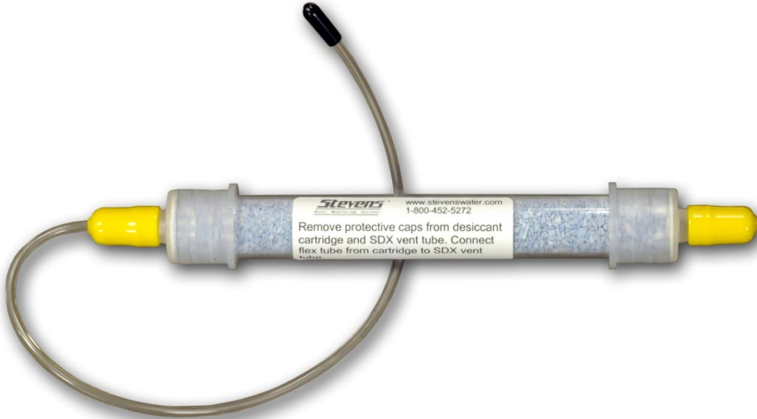
Optional Desiccant Cartridge Figure 3

The pressure transducer used is a “Wet-Wet” device. While it is important to keep the SDX cable’s vent tube unobstructed for barometric pressure compensation, this feature results in neither the pressure transducer nor internal electronics becoming damaged by condensation or moisture entering the SDX cable’s vent tube. However, it is possible for vapor to condense into water which could create an offset in the transducer output. Therefore, Stevens recommends the desiccant cartridge with vent tube adapter be installed to prevent moisture from entering the vent tube.